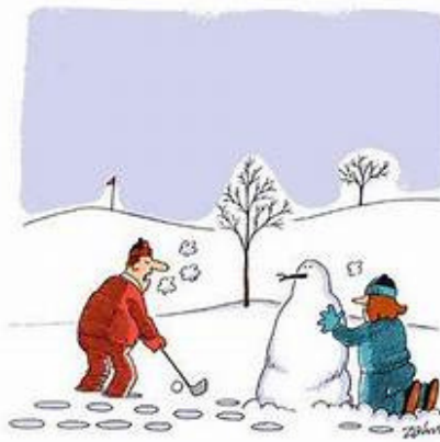
"Are you going to play golf or not, Sally?"

April is a month of change. We say goodbye to curling and hello to golf! The office and clubhouse have packed up and moved across the street, back to the golf course. There are many updates and exciting things happening at the golf course this season that we are anxious to share with you. It won't be long now,, although you wouldn't know it based on this crazy weather!